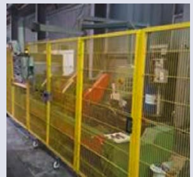
The new safety cage on a stranding machine.

This investment in better protective equipment is not insignificant. It is, however, essential in our efforts to actively improve occupational safety. After installing new protective equipment, the points of access to the machine were also fitted with new controls (safety PLC).