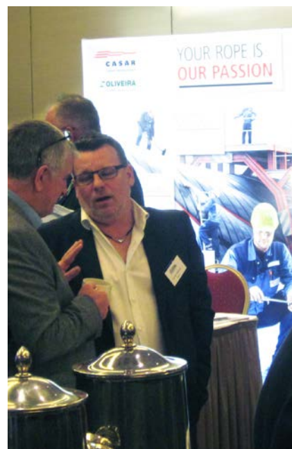
Intense discussions at the WireCo stand

The WireCo stand was once more the place to be for intense discussions on the optimal use of special wire components from the brands CASAR and OLIVEIRA. Also sponsored by WireCo, an extremely interesting boat tour took place the day before the event. Under expert guidance, participants were able to experience anew the fascinating large-scale construction sites from the Thames.