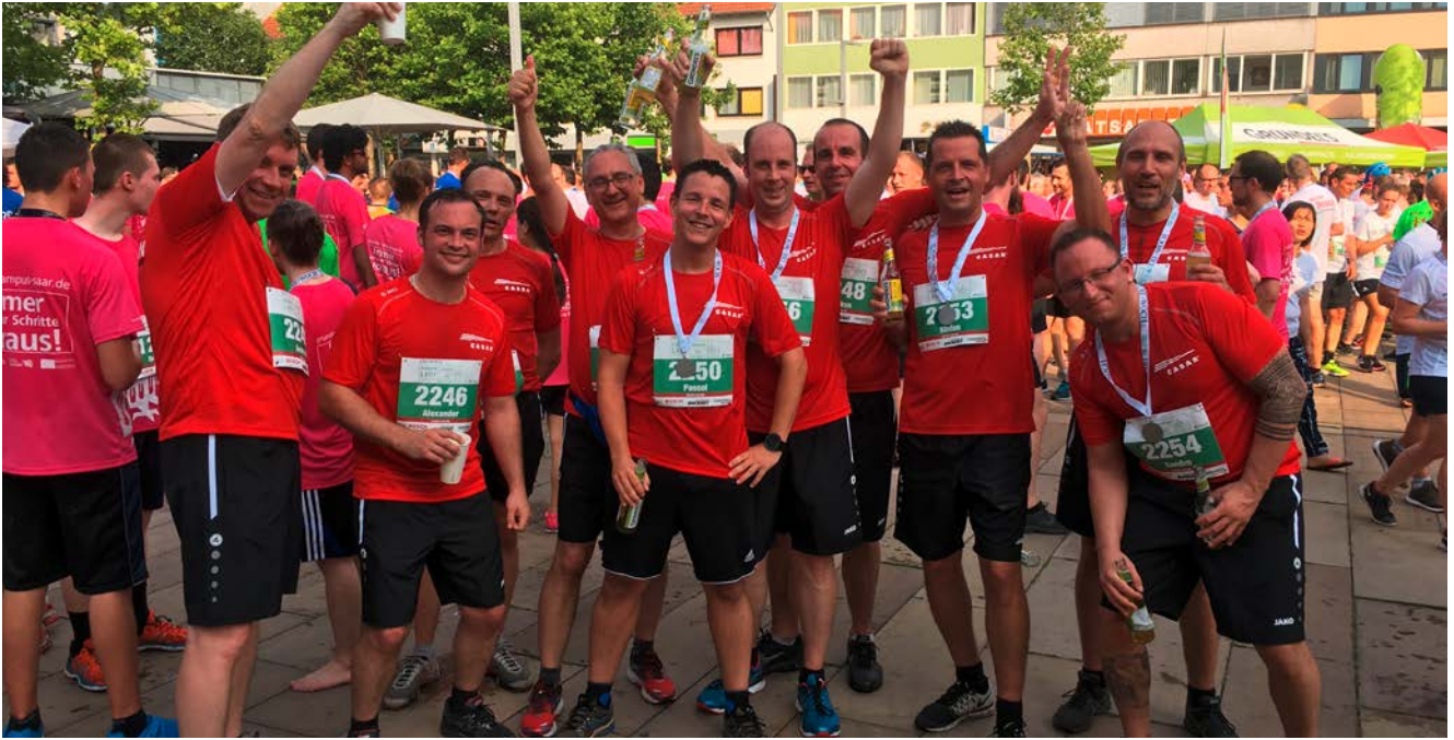
The CASAR running team