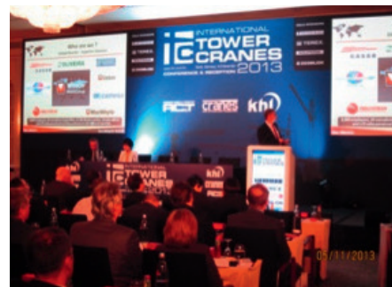
KHL Tower Crane Conference in Berlin, November 2013